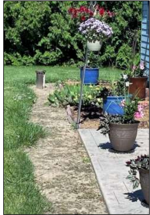
A homeowner's use of pesticides near a well can increase the potential for well contamination.

BLS performed all groundwater analytical testing using GC/MS/MS and LC/MS/MS in accordance with ISO 17025 accreditation standards. All samples were tested for 107 pesticides and nitrate. A full listing of compounds analyzed is included in Appendix A along with established and proposed Preventive Action Limits (PALs) and Enforcement Standards (ESs) for each compound (ch. NR 140, Wis. Adm. Code).